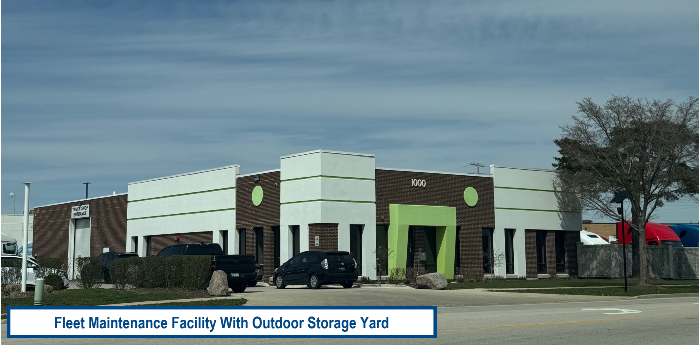
Fleet Maintenance Facility With Outdoor Storage Yard